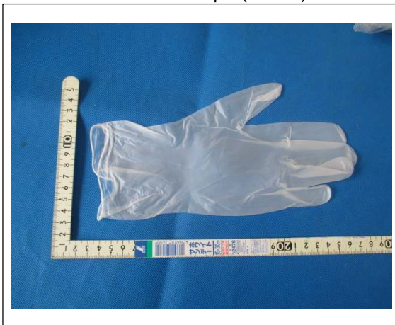
Received sample (size M)