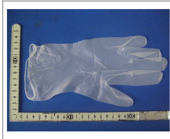
Received sample (size S)