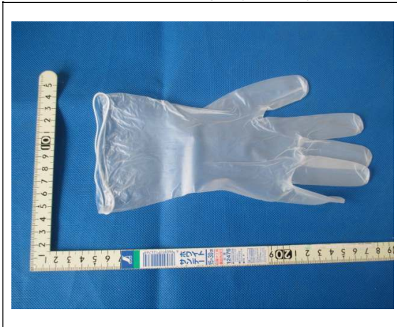
Received sample (size XS)