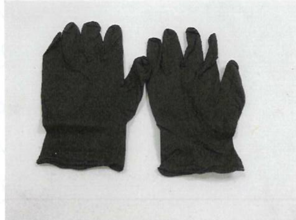
Gloves described as Disposable medical nitrile examination gloves (BS010205 – Black)