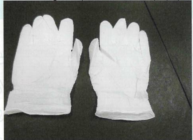
Gloves described as Disposable medical nitrile examination gloves (BS010204 – White)