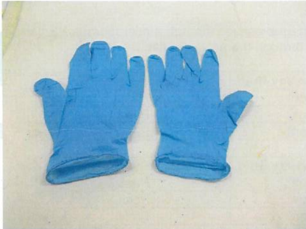
Gloves described as Disposable medical nitrile examination gloves (BS010201 – Blue)