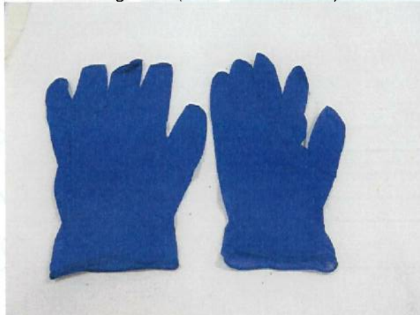
Gloves described as Disposable medical nitrile examination gloves (BS010203 – Cobalt blue)