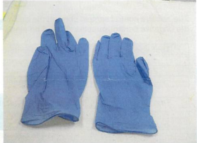
Sample described as Disposable medical nitrile examination gloves (BS010202 – Blue purple)